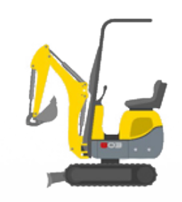
Compact excavator 803